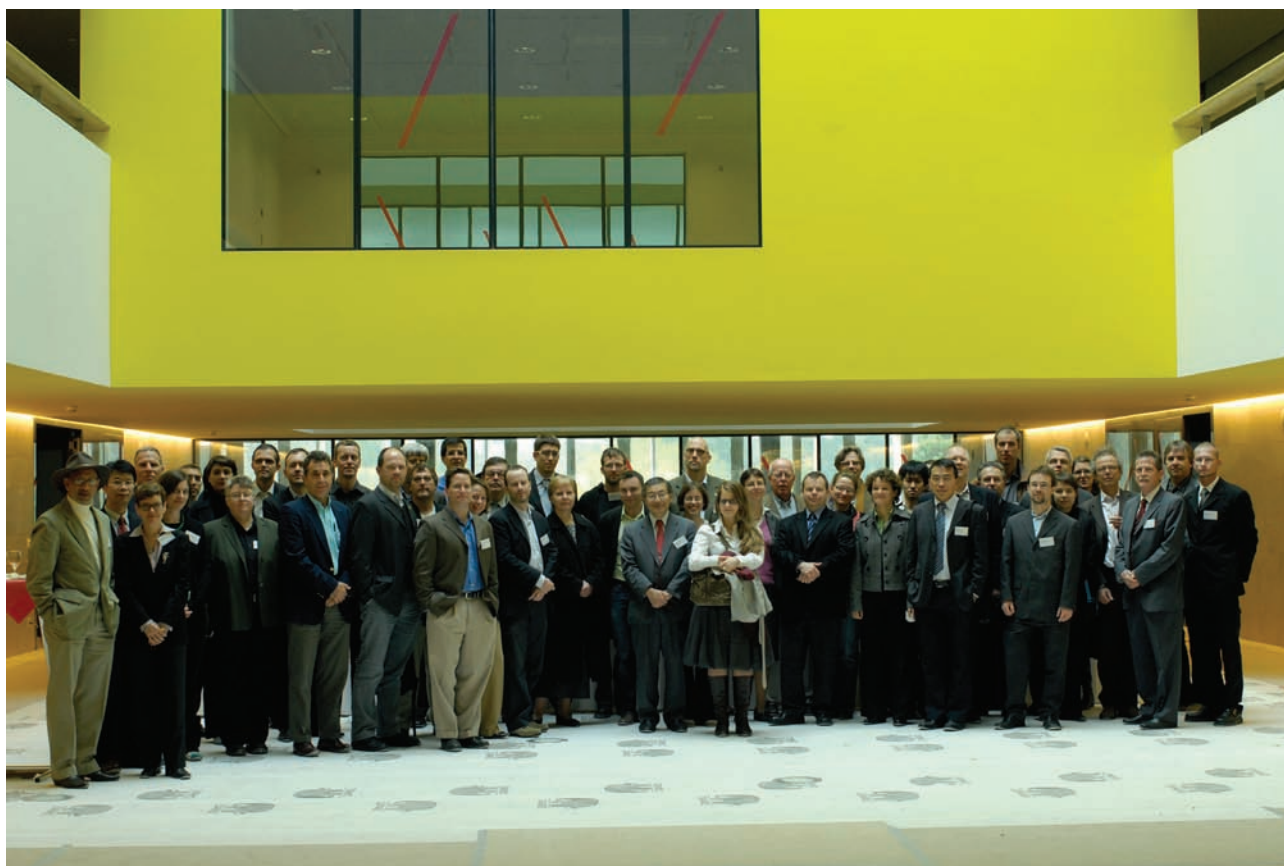
Participants of the Second Annual ISCN Conference , April 23–25, 2008