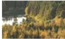
The Sustainable Student