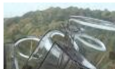
The Sustainable Laboratory