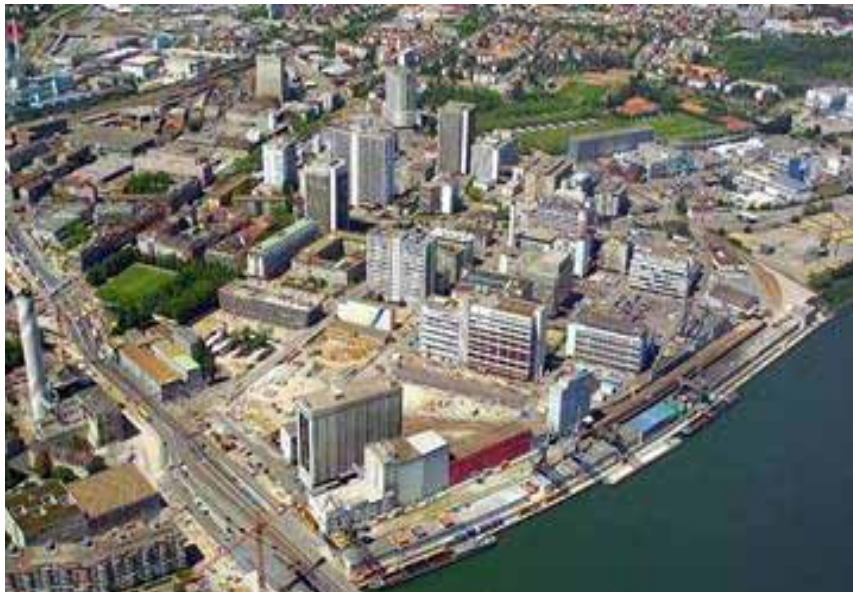
13 | June 2009 | Novartis Sustainability and Campus | Business Use Only

Administration and research Corporate Headquarters up to 10,000 people